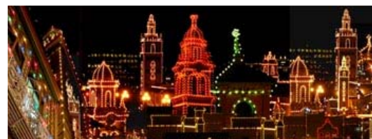
Christmas Time at The Country Club Plaza