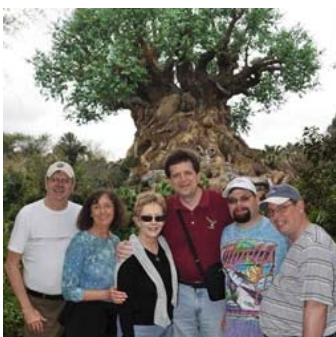
In front of Disney's Tree of Life